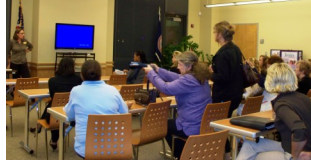
The Hopewell Domestic Violence Taskforce presented Beyond Stranger