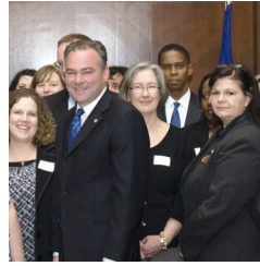
Gov. Kaine signed legislation