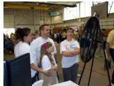
Summer Health and Wellness Festival in Hopewell