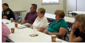
The Colonial Heights DVTF