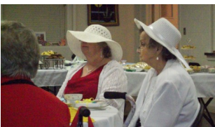
Nazareth Lutheran hosted a tea party to help raise funds for The James House. It was marvelous!