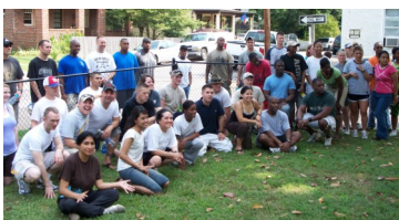
Officers in Training August Fence Paining Project