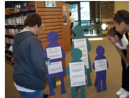
Local youth check out our Go Figure.... figures on display at the Hopewell Library during DV Awareness Month