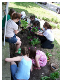
Girl Scout Troop #360 of Prince George created an Angel Garden