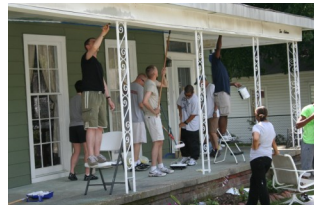
Officers in Training September Painting Project