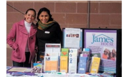
Hispanic Family Day Fair in Chesterfield