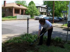
VCU students work to complete their service learning projects